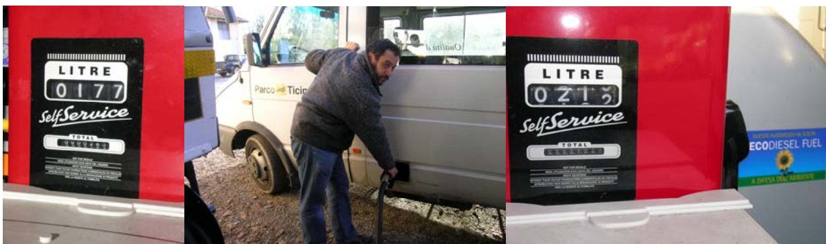
Figure 3 - Liter-counter before and after the fuelling to a van.