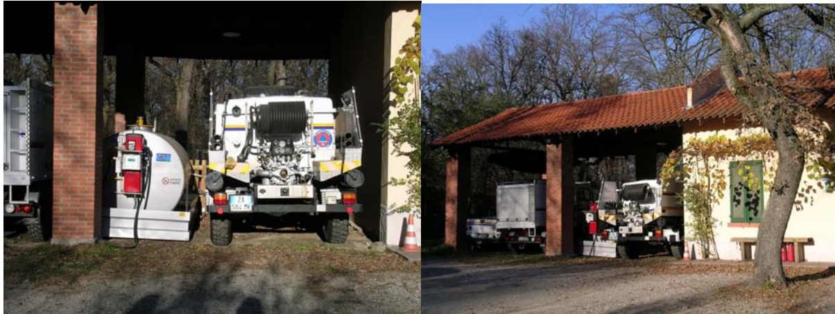
Figure 4 – Location of fuel station.