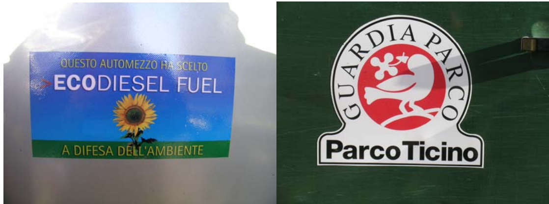
Figure 1 - Sticker showing that the vehicle is fuelled with ECO-DIESEL – Logo of Park Keeping vehicles